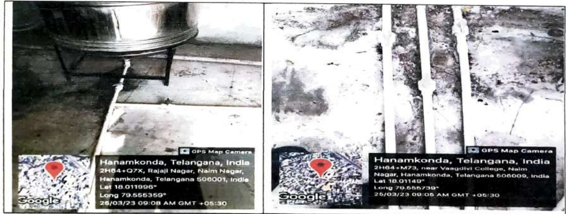
Water Distribution Systems in the College from the Tanks

There are adequate facilities available in the campus for the maintenance of water bodies and subsequent water distribution system to fulfill the various needs of the users. Well-laid pipe network is arranged to distribute the stored water from ground point to various tanks within the campus.